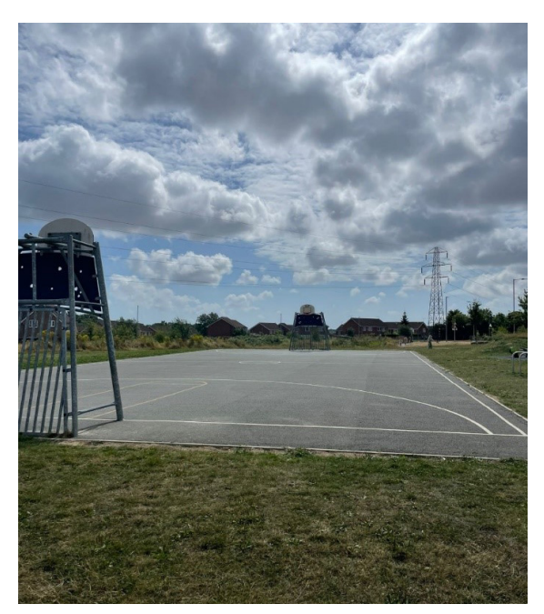
Figure 7. New all-weather surfacing on the basketball area within Great Chart and Singleton.

6.22 The Great Chart with Singleton Parish Council has used S106 funding to provide an all-weather surface for their basketball area. This new surfacing means that the facility can be used year-round and the Parish Council has seen an increase in the number of residents using the basketball area.