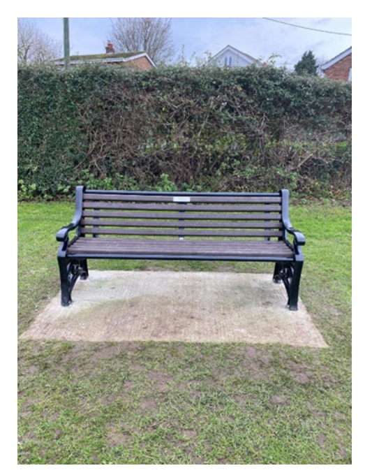
Figure 6. New bench to the Warren in Brabourne.

6.17 Brabourne Parish Council used funding they received to replace a park bench on the Village Green to ensure residents have a place to rest when visiting the green and to enjoy the surrounding views of Brabourne Lees. Funding was also received for grass cutting within the Parish.