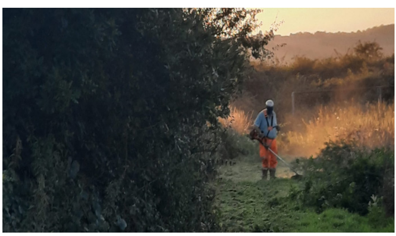
Figure 1. Maintenance work being undertaken by the Appledore Allotment Charity.

6.3 In July 2023, Appledore Parish Council nominated 2 representatives to serve a four removing an area of overgrown land along with feral tree, repurposing and renewing has been purchased, with the assistance of the S106 funding, to install rabbit proof fencing around the allotments.