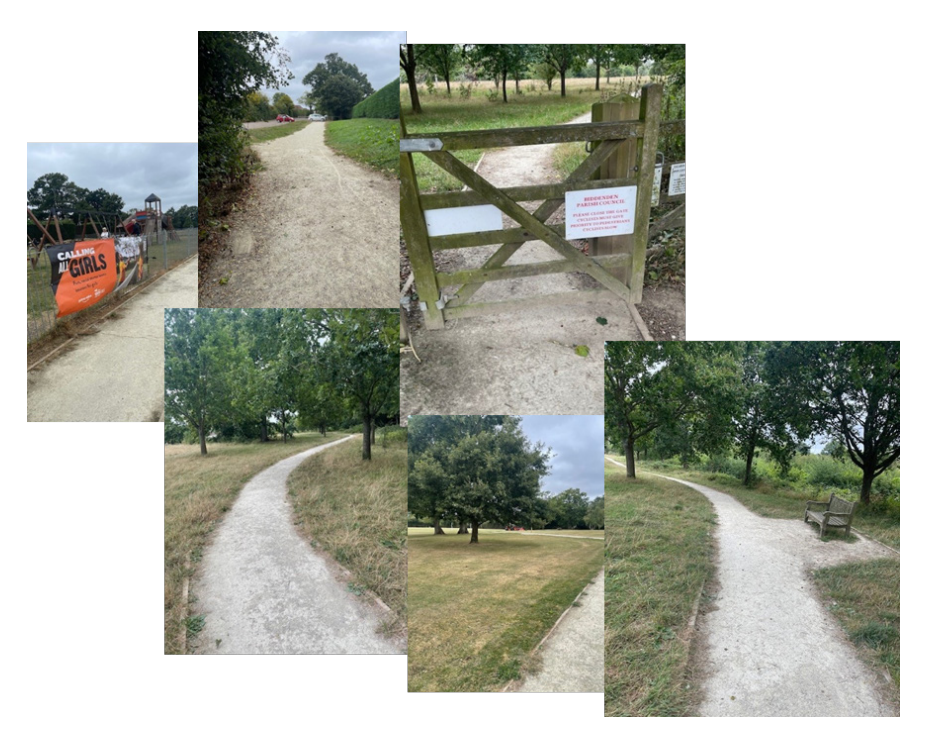
Figure 5. Biddenden Multipurpose Trail.