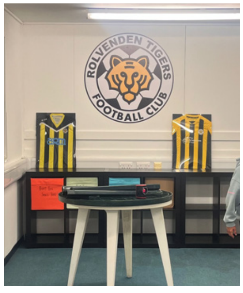
Figure 9. Improvements made to the Rolvenden Football Club.

6.29 Rolvenden Football Club received S106 funding to improve their facilities, undertaking repairs to the clubhouses' roof, install insulation with cladding, and improve the appearance of the clubhouse. Funding was also used to install a CCTV system, helping to resolve occurring security issues the football club has been experiencing.