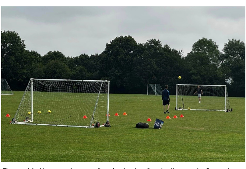
Figure 11. New equipment for the junior football team in Smarden.