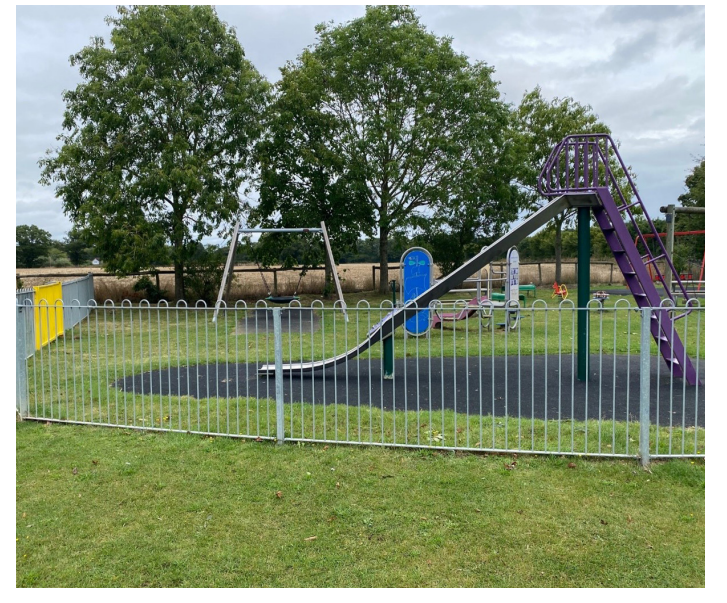
Figure 10. The new additions and renovations to the Shadoxhurst play area in the village's playing fields.