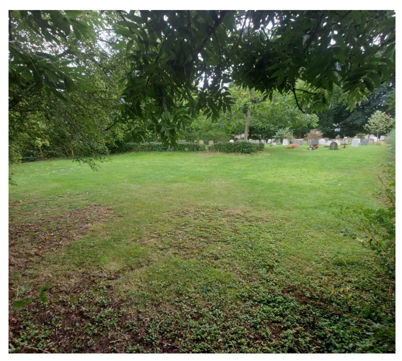
Figure 4. Extension to St. Margaret's burial ground within Bethersden Parish.