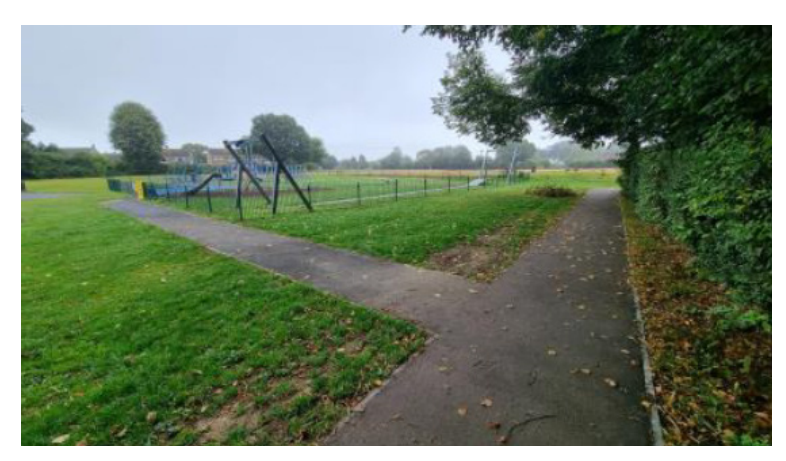
Figure 12. New inclusive pathway on Hythe Road, Willesborough.

6.39 Funding was used to install a tarmac pathway in Willesborough recreation ground to allow all year-round and inclusive access to the park and cemetery